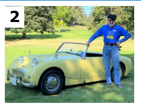
Kent Green 1959 AH MK1 Sprite