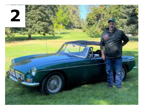
Jim Holloway 1969 MGB Roadster