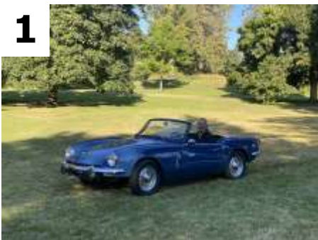
Byron Kreck 1969 Triumph Spitfire MK3