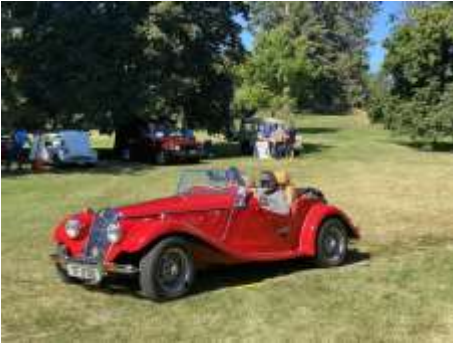
Roger Slater 1985 Naylor TF 1700