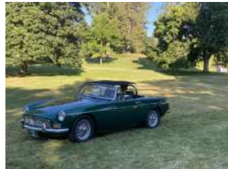
Jim Holloway 1969 MGB Roadster