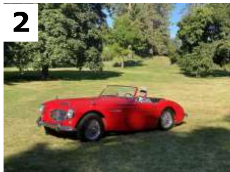
Jim Miller 1961 AH 3000 MK1