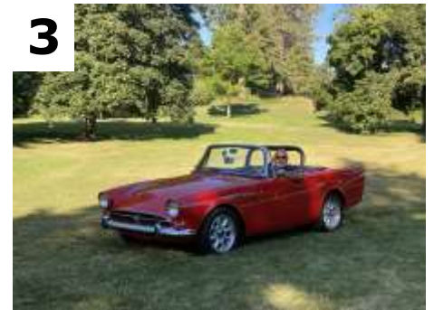
Classic Car Holdings/ Klaus Kindor 1966 Sunbeam Tiger