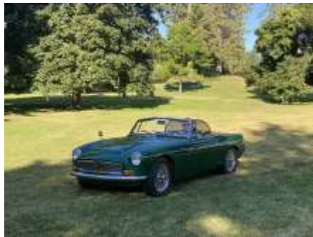
Charles Brennan 1969 MGC