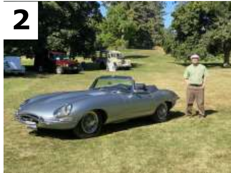
Bill Hughes 1967 Jaguar E-Type