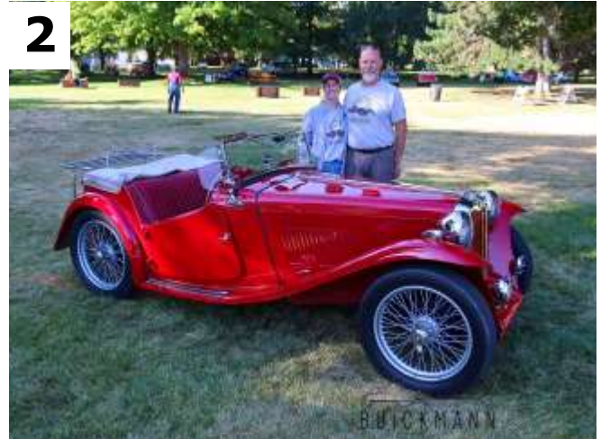
Preston & Kamela Potratz 1949 MG TC