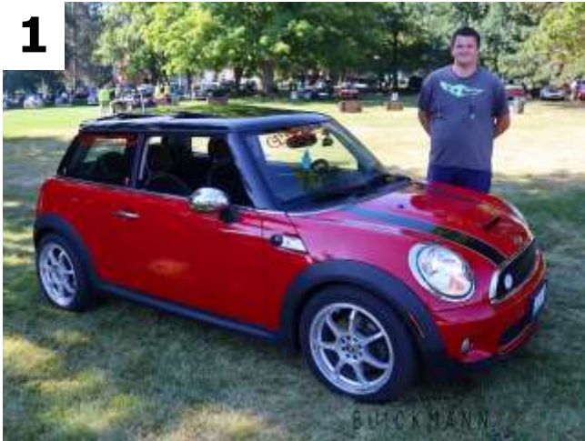
Rusty Wolf 2009 Mini Cooper S R56