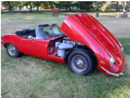
Dave Hofstadter 1969 Jaguar E-Type