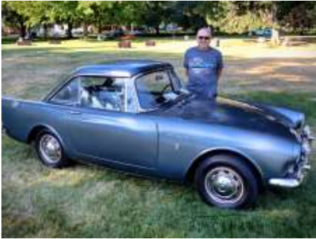
Brian Westmoreland 1963 Sunbeam Alpine S3