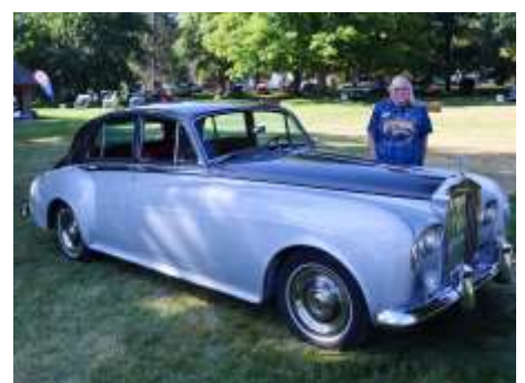
Marianne Dawson 1963 Silver Cloud III