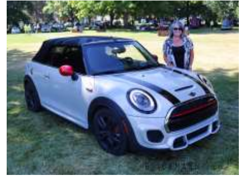
Stacy Blair 2017 Mini Cooper Convertible