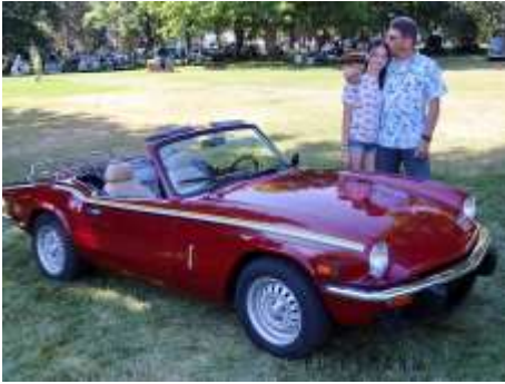
Gerald Schmer 1979 Triumph Spitfire 1500