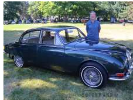
Simon Thompson 1965 Jaguar 3.8 S