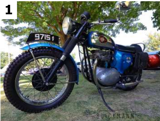
Chuck Silva 1967 BSA Royal Star 500