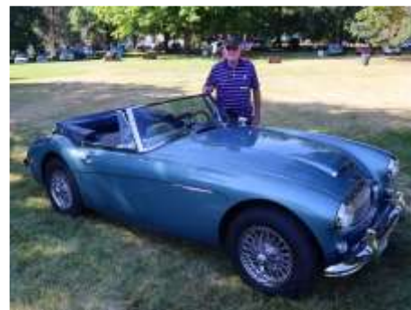
Ed Louderback 1965 AH 3000 BJ8