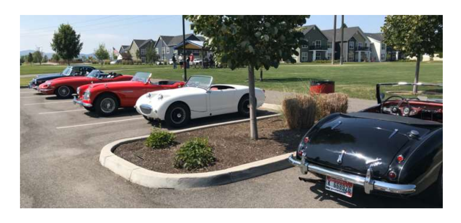
Some 15 classic LBCs arrived for the July meeting.