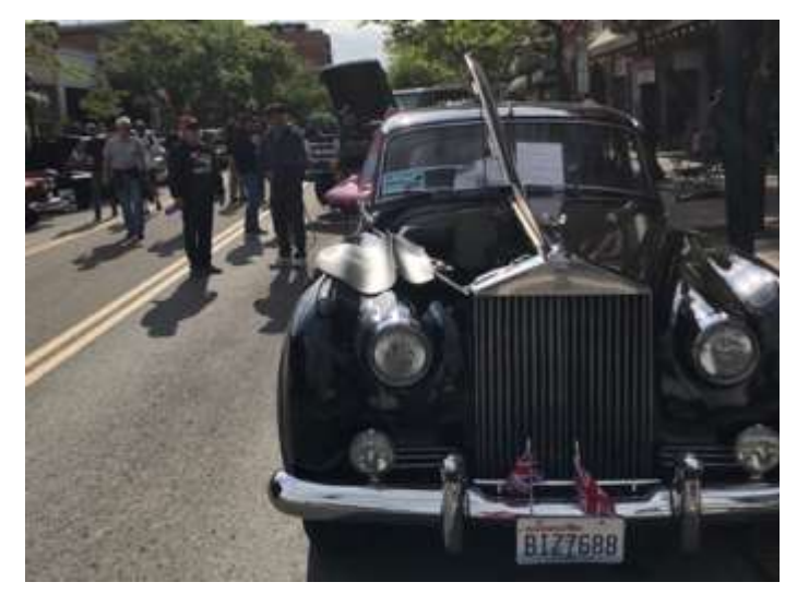
Irwin and Judy Chapin and their Rolls

NWBC dresses up the June 18<sup>th</sup> Car d'Lane Classic Car Show in downtown Coeur d'Alene.