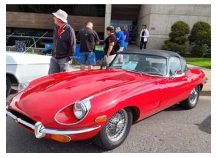
Dave Hofstadter brought his E-Type

There were approximately 800 classic cars in the Friday night cruise, and over 400 cars in the Saturday car show. The weekend primarily featured cars of 1980 vintage and earlier.