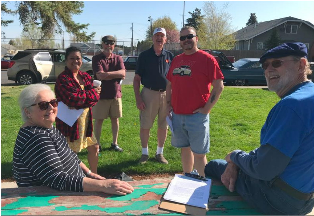
Team NWBC strategy meeting before the start.