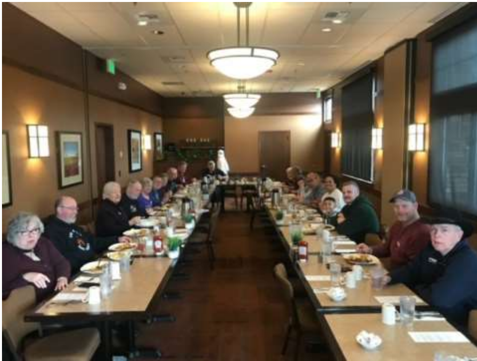
Depending on where they came from, twenty-one members braved from five to 12 inches of snow to attend the NWBC breakfast meeting on March 12th